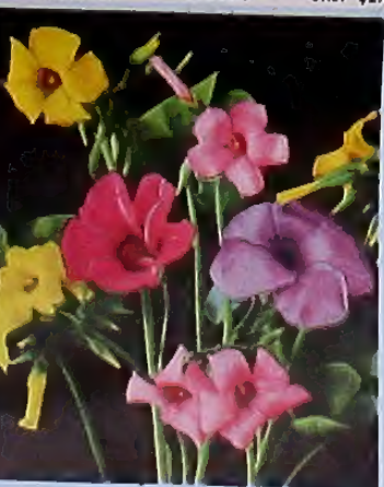
FLOWERING SHAMROCK (Oxalis)

Striking, colorful, low growing, with shamrock-like foliage. Excellent for borders and edging. Ideal for indoor culture. Makes a showy color mass with shades of Yellow, Pink, White and Lavender. Mixed colors.